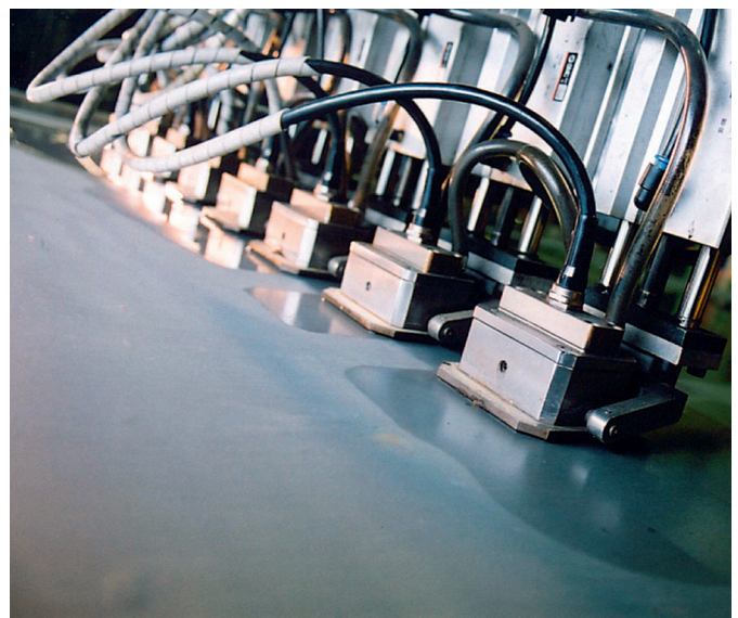
Fig. 2.3_3: Ultrasonic testing already during goods inwards inspection